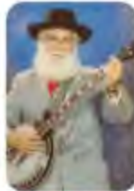
Banjo Man Live Bluegrass Music Honorary MRVSEA Life Member

But so much more than Steam Engines and Tractors.